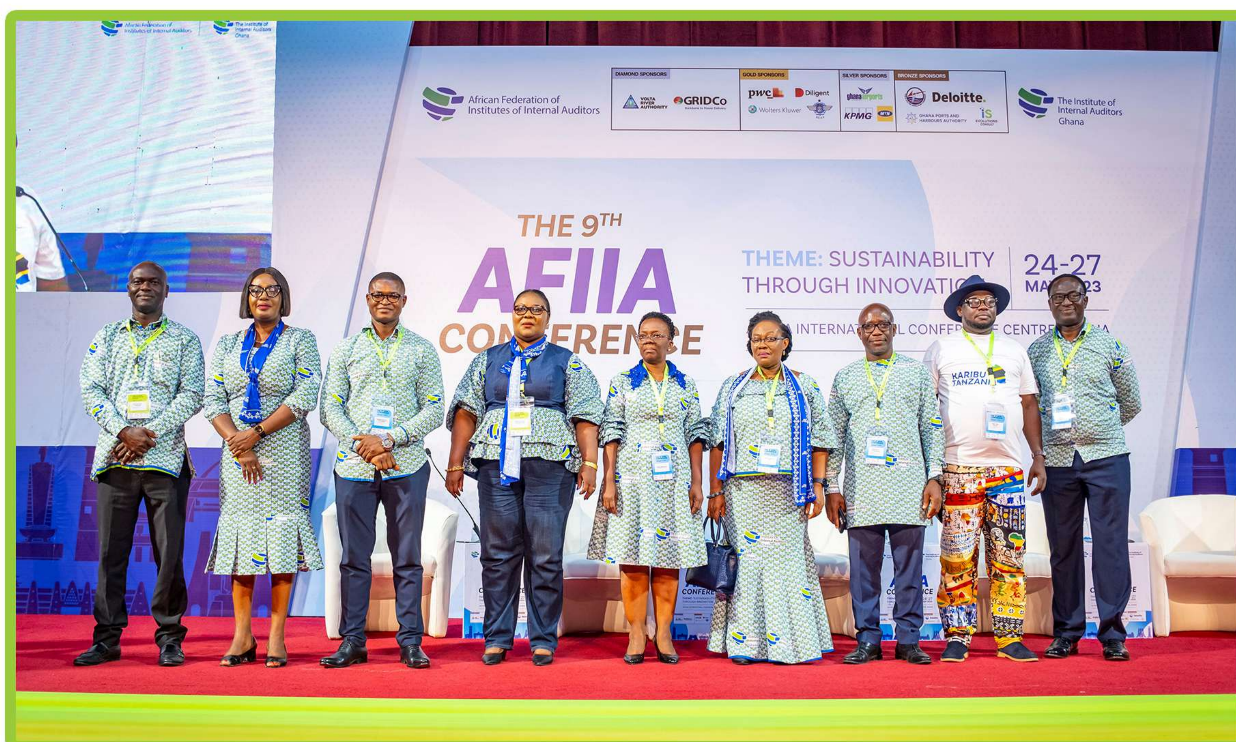
AFIIA 2023 Organising Committee