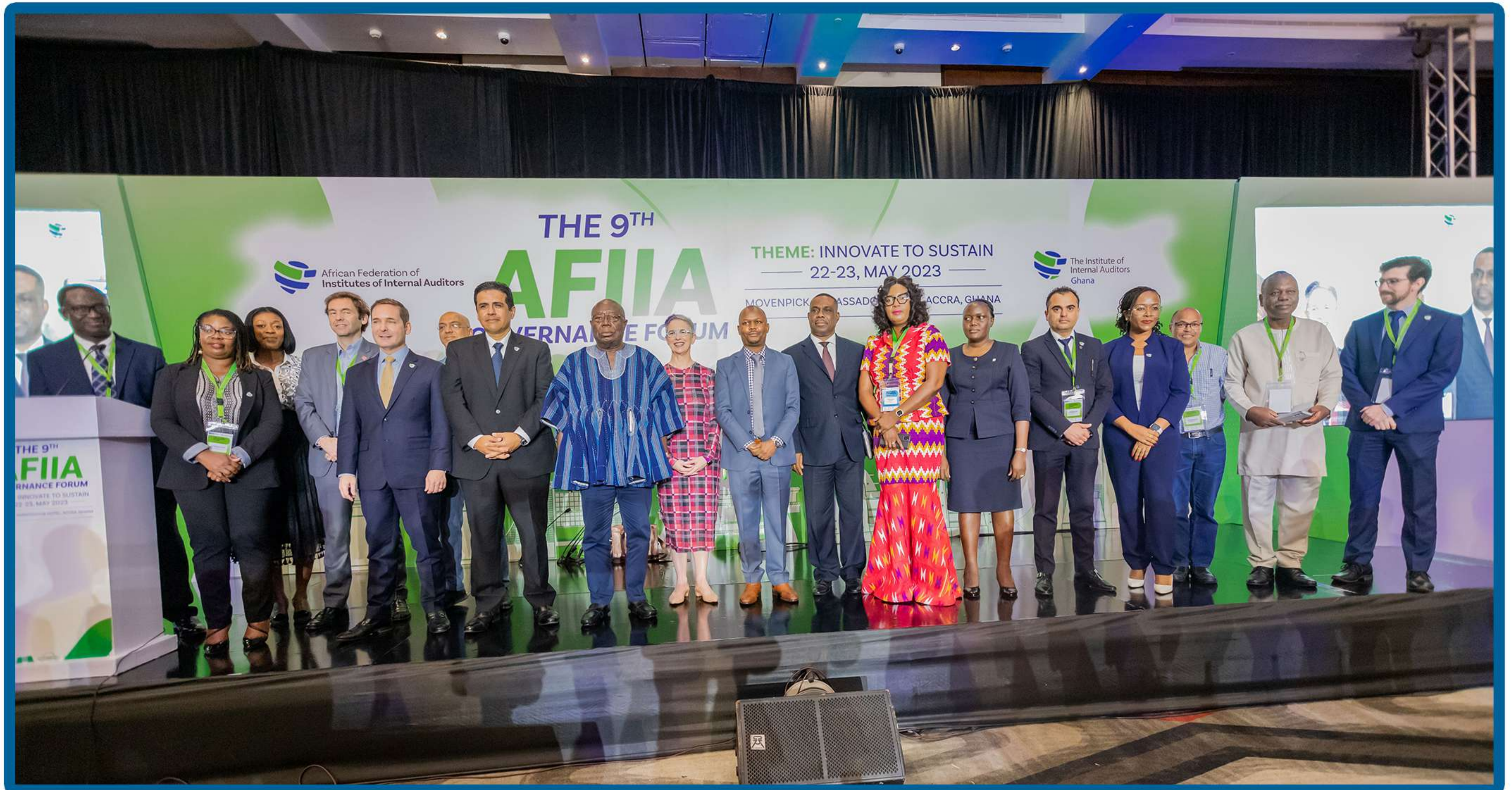
Dignitaries in attendance at the opening of the AFIIA Conference